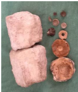
Rock Solid People by Dana Armstrong

A place to share knowledge of fossil, gem, and mineral collecting.